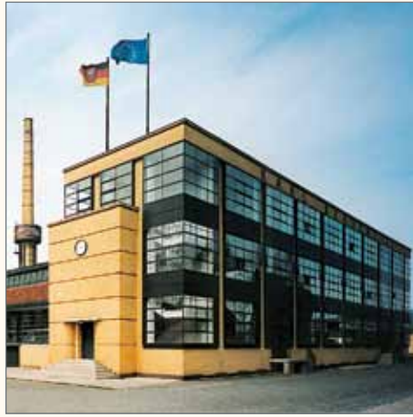
OUR HEADQUARTERS AT ALFELD - BUILT BY WALTER GROPIUS IN 1911