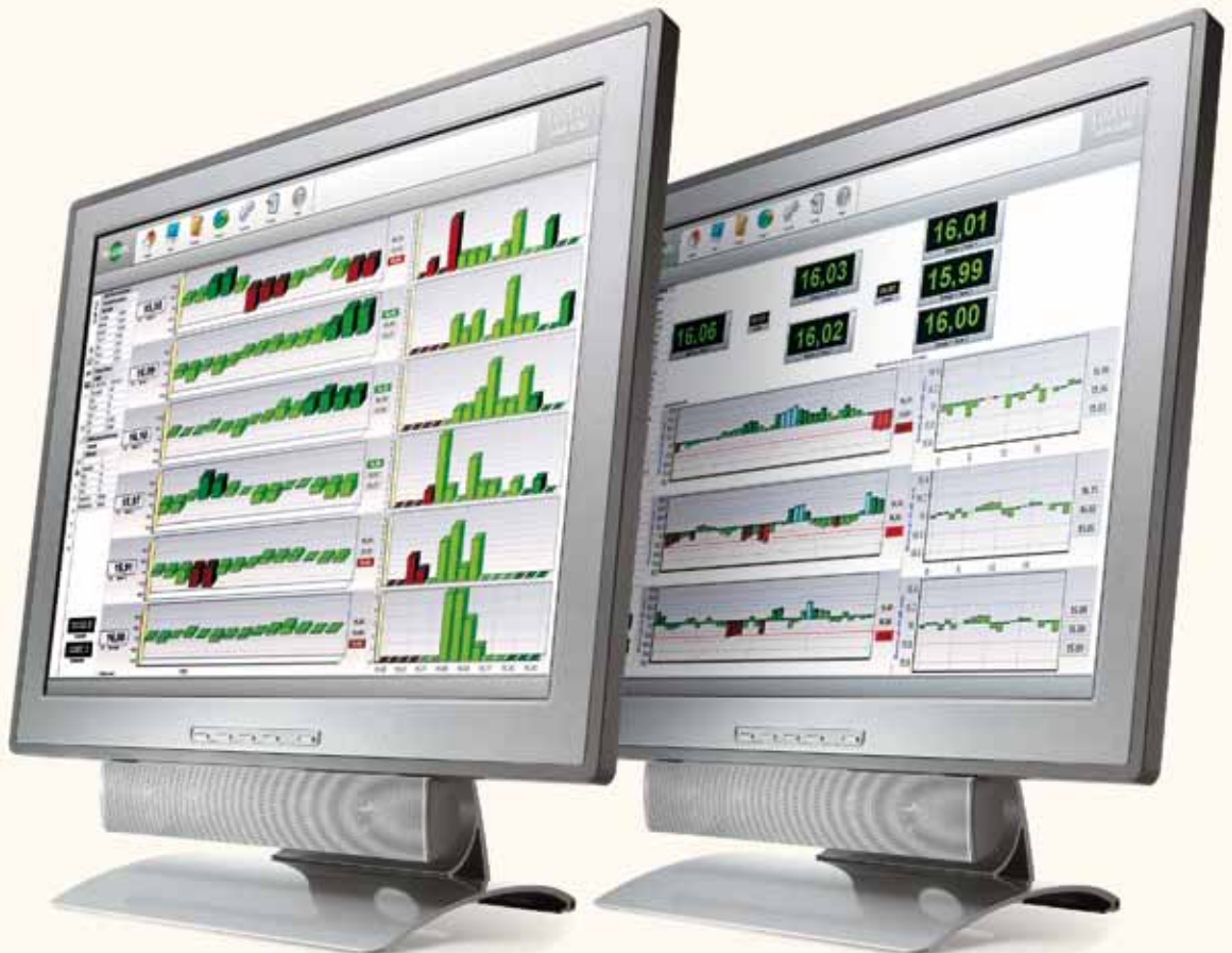
Visualisation raw panel production

GreCon measuring systems are equipped with a modem or VPN, which provides a direct connection to GreCon service when needed. Support, changes in parameters, software updates and trouble shooting are all possible online.