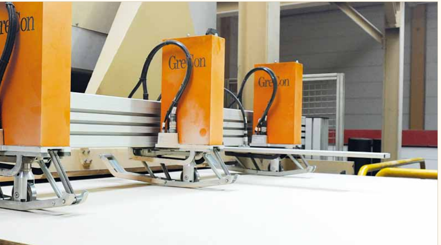
Measurement after sander