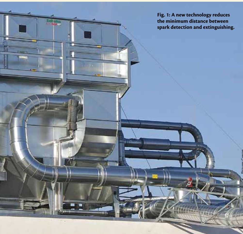
Fig. 1: A new technology reduces the minimum distance between spark detection and extinguishing.

protect subsequent facilities from fires or explosions.