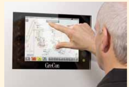
Fig. 3: The control panel offers touch and slide operation.

In any case, it is always worthwhile to ask an expert, because fire and explosion prevention is always better than to fight against damage. Usually spark extinguishing systems do not interrupt the running working process, but rather minimize breakdowns. ■